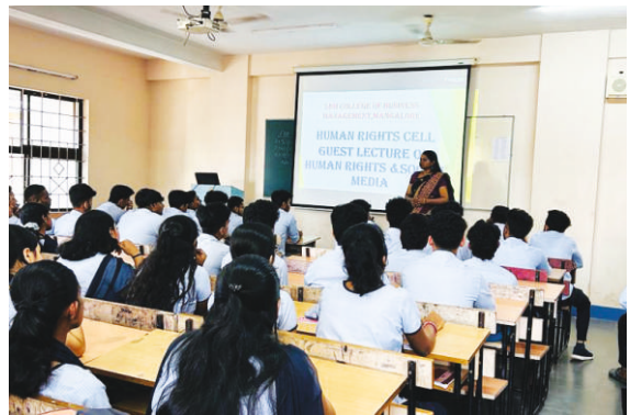
Class room fixed with LCD