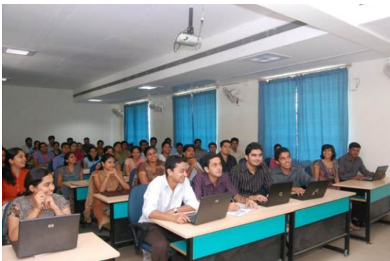
WiFi Enabled campus