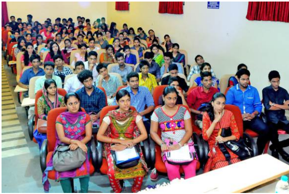
Air conditioned seminar Hall