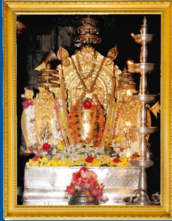
Lord Shri Manjunatha Swamy Shree Kshethra Dharmasthala