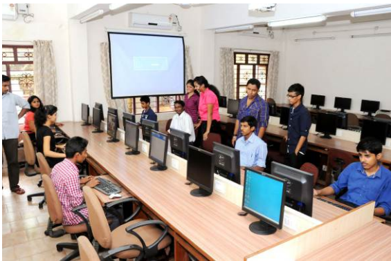
State of the art Computer Lab