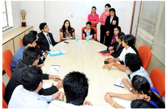
Air conditioned Discussion room