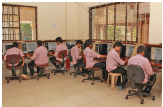
Learning resource center