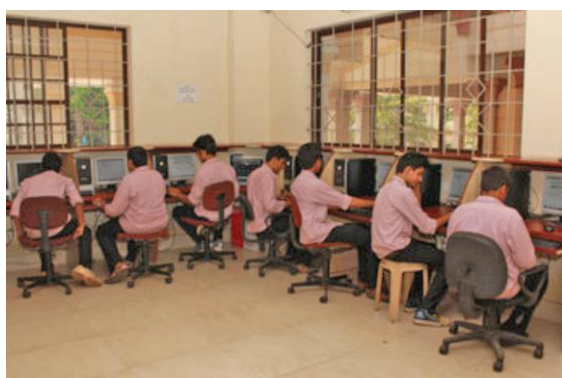
Learning resource center