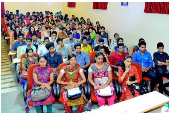
Air conditioned seminar Hall