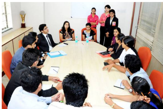
Air conditioned Discussion room