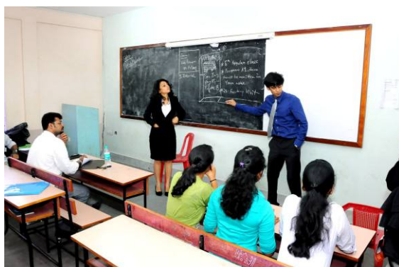
Class room fixed with LCD