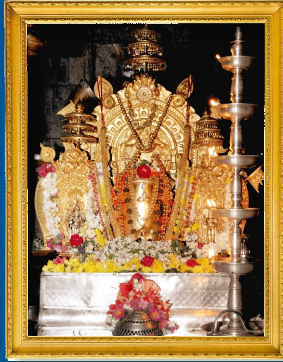
Lord Shri Manjunatha Swamy Shree Kshethra Dharmasthala