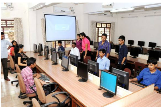
State of the art Computer Lab