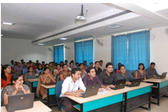
WiFi Enabled campus