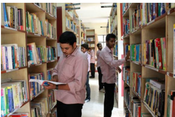
Well equipped Library