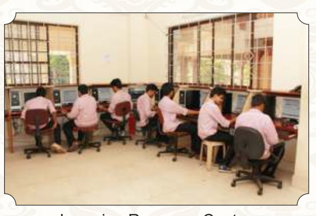
Learning Resource Center