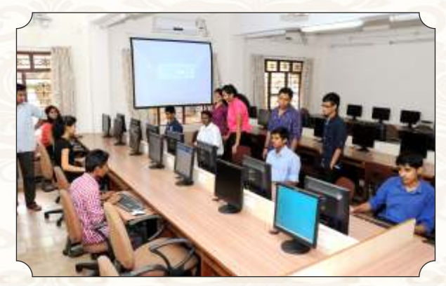
State of the art Computer Lab