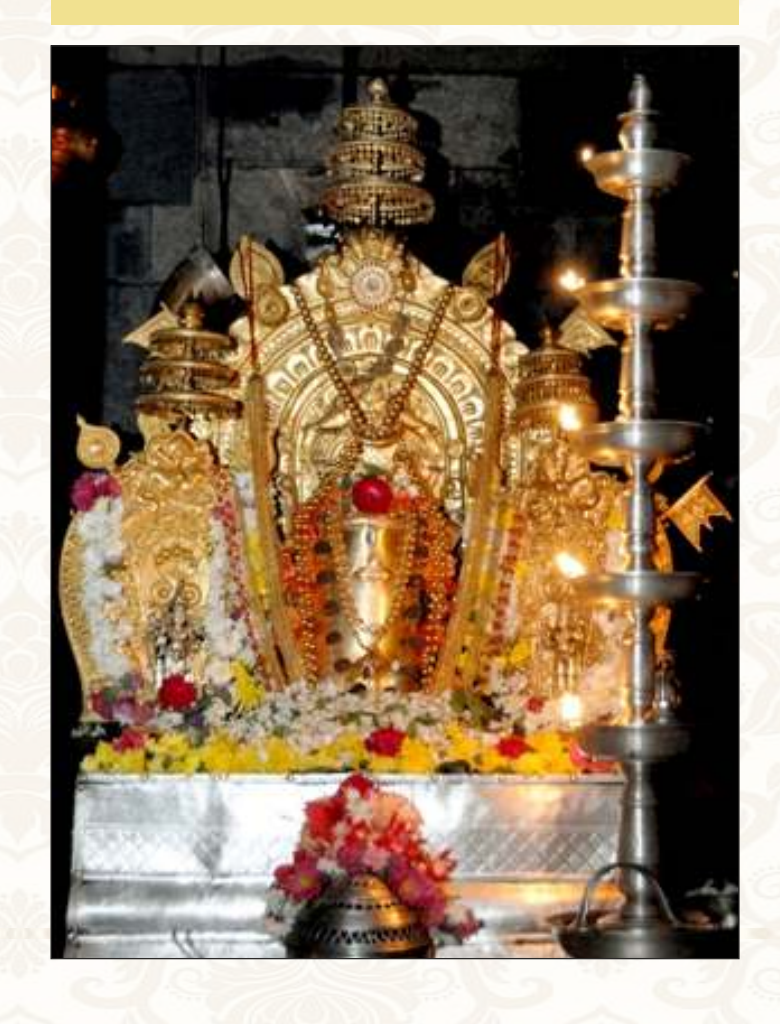
Lord Shri Manjunatha Swamy Shree Kshethra Dharmasthala