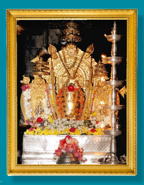
Lord Shri Manjunatha Swamy Shree Kshethra Dharmasthala