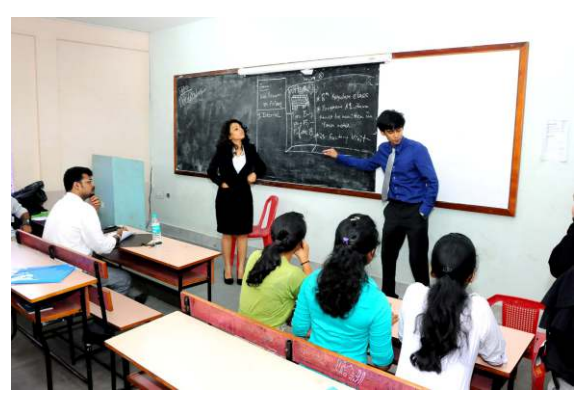
Class room fixed with LCD