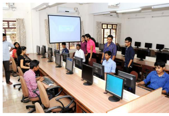
State of the art Computer Lab