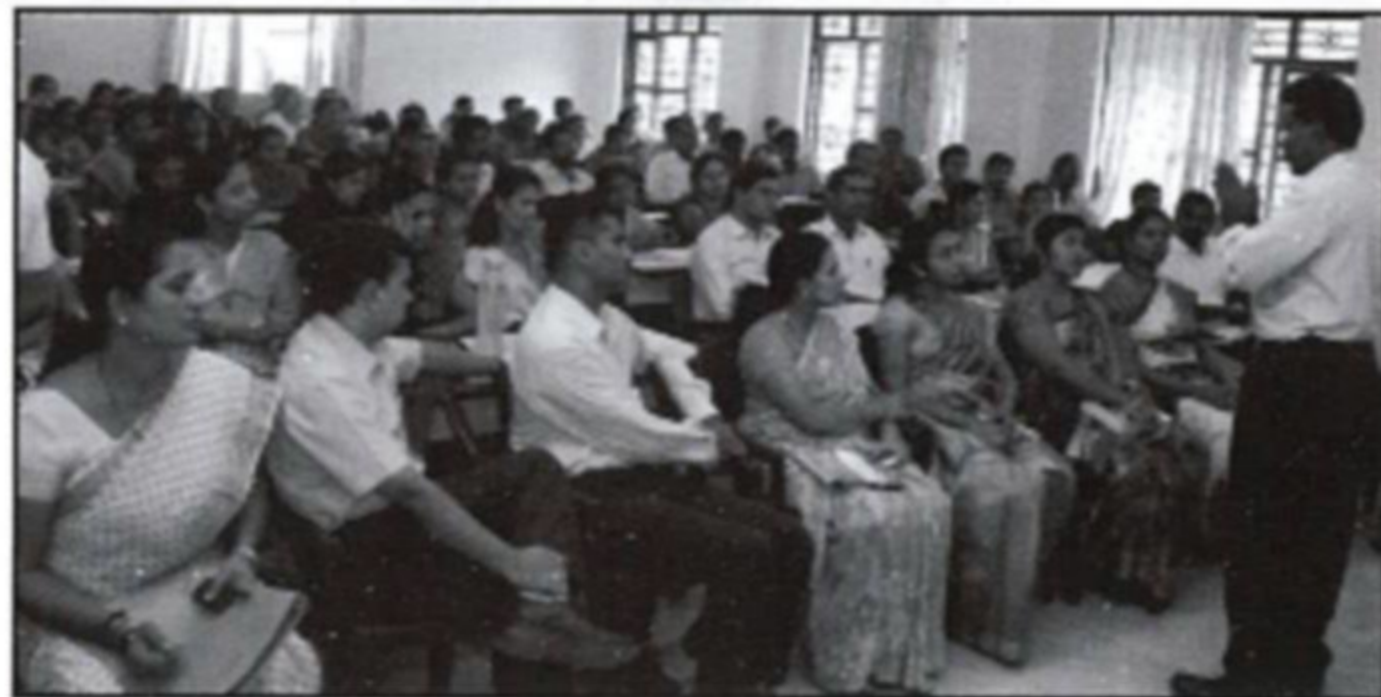
BCA Syllabus Workshop