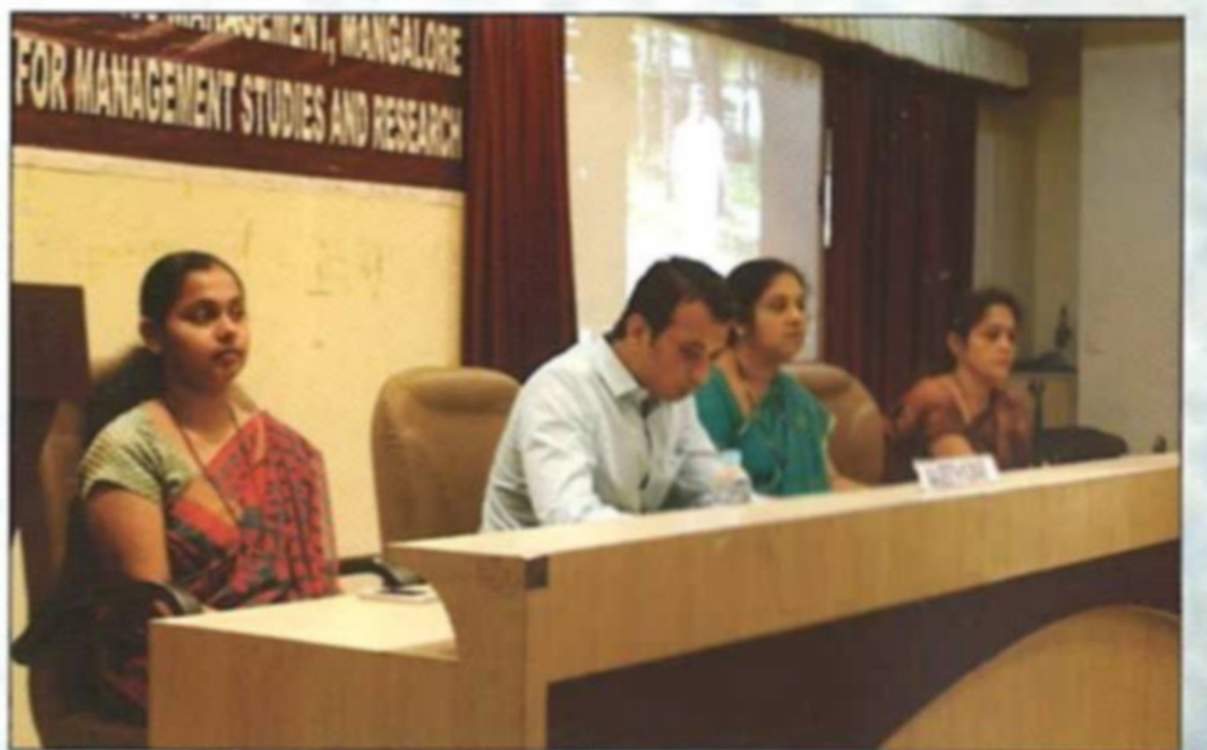
Green Marketing - Guest lecture