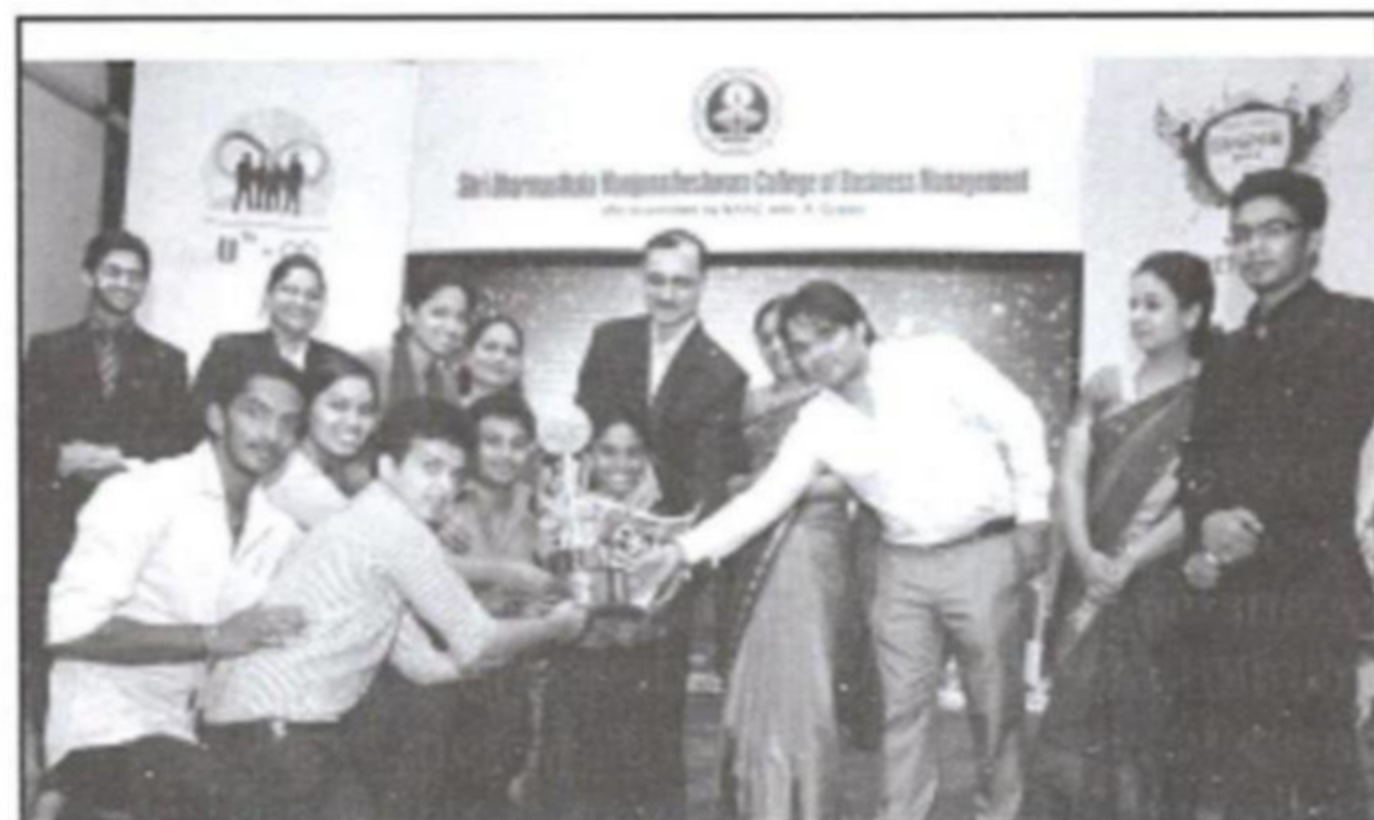
Overall Championship Trophy - Synergy