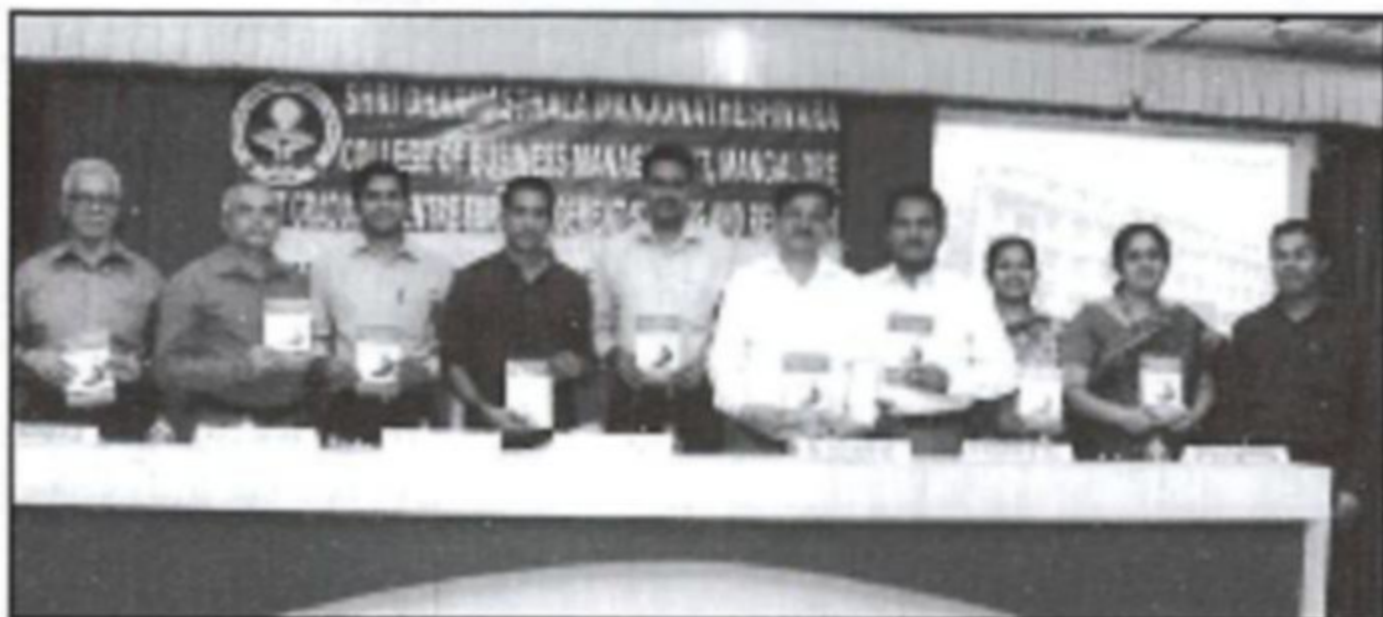
Release of Book