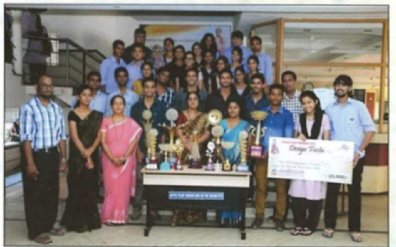
Overall Champions of IT Fests