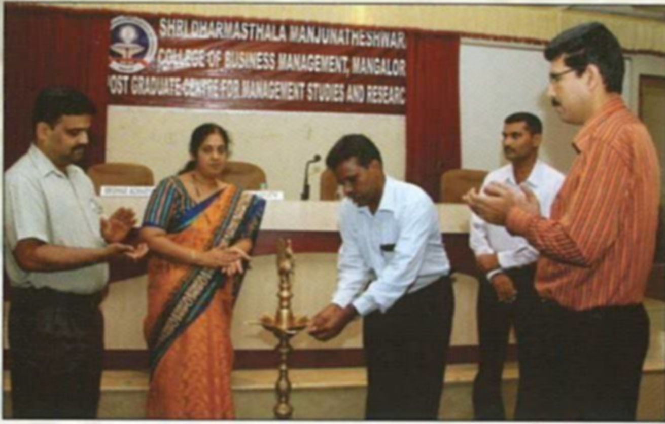
BCA Syllabus Workshop