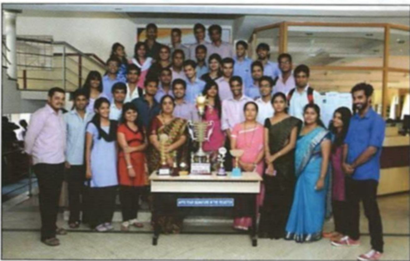
Overall Champions of Management Fests