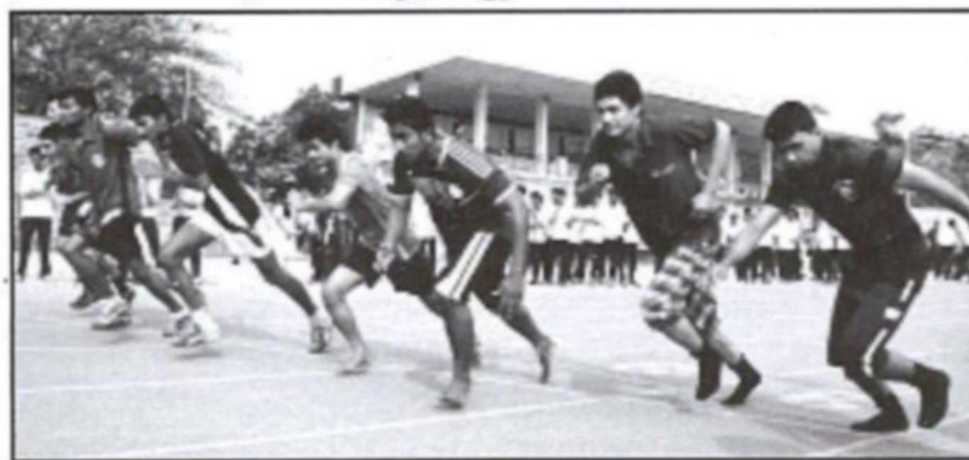
1 2 3 Go - Sports Day