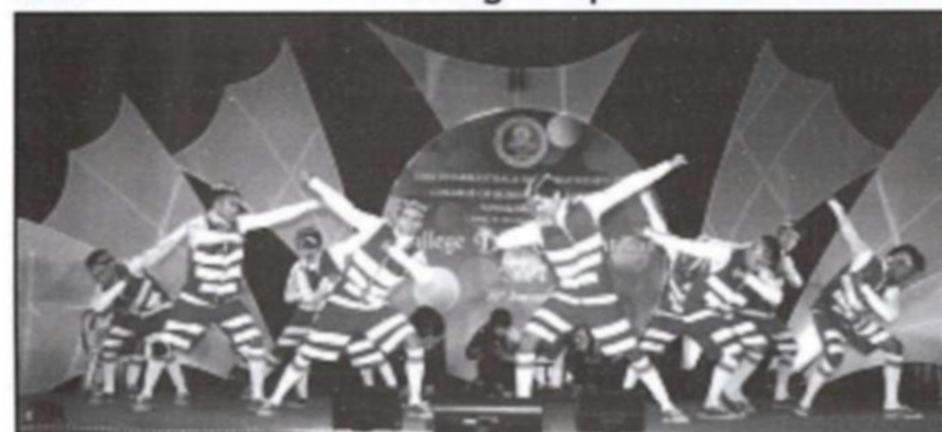
Cultural Programme in College Day Function