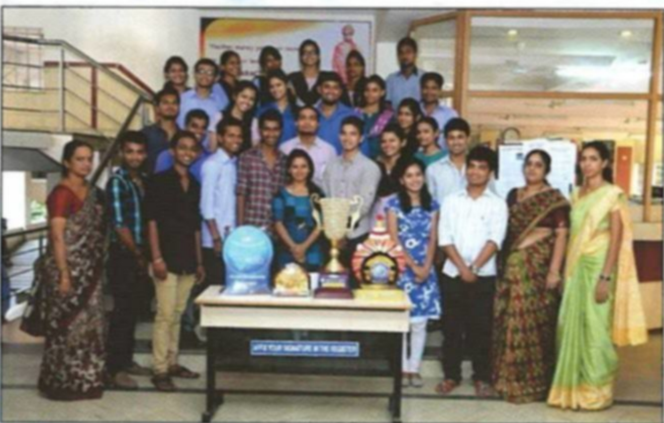
Overall Champions of Cultural Fests