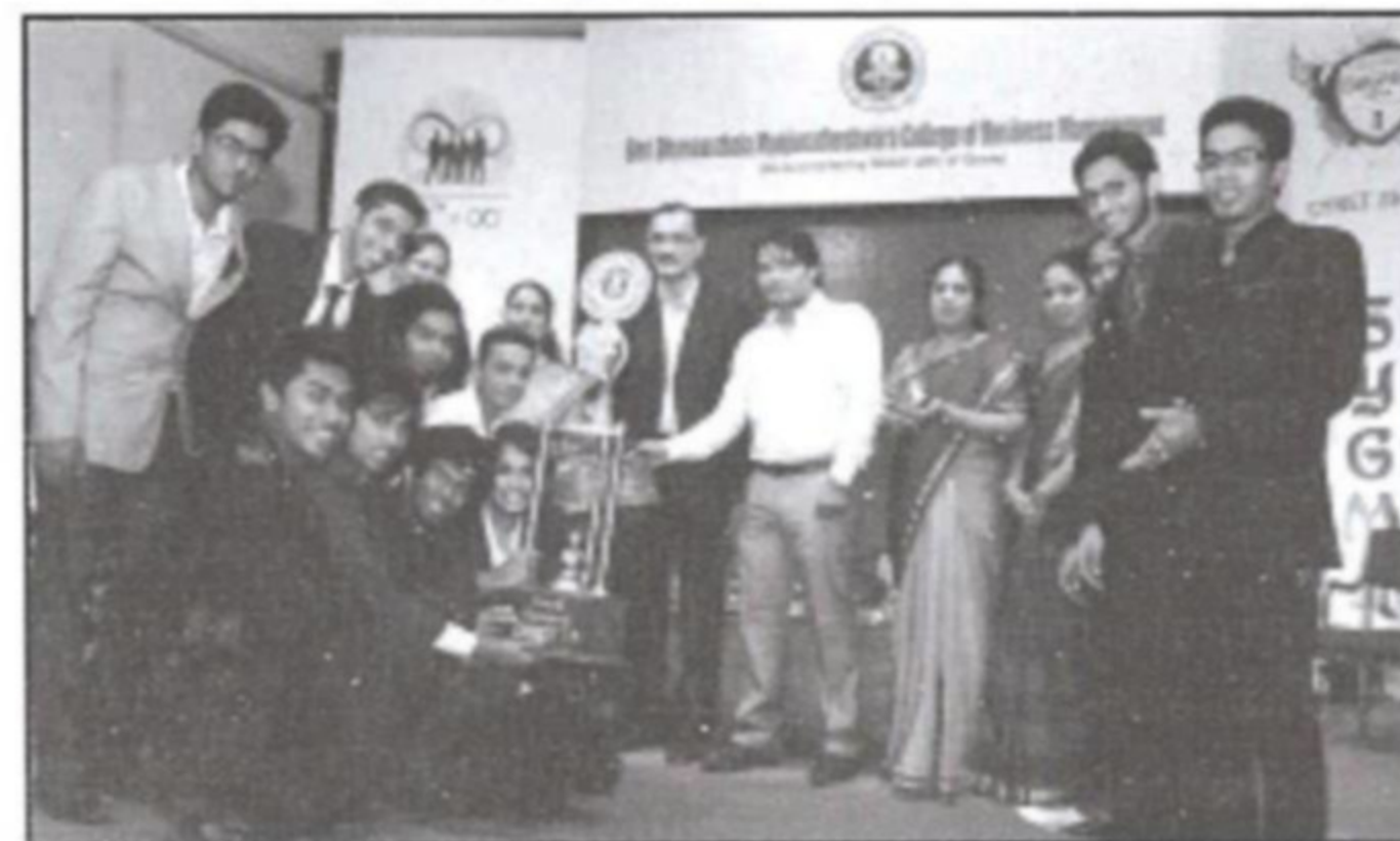
Overall Championship Trophy - Sygma