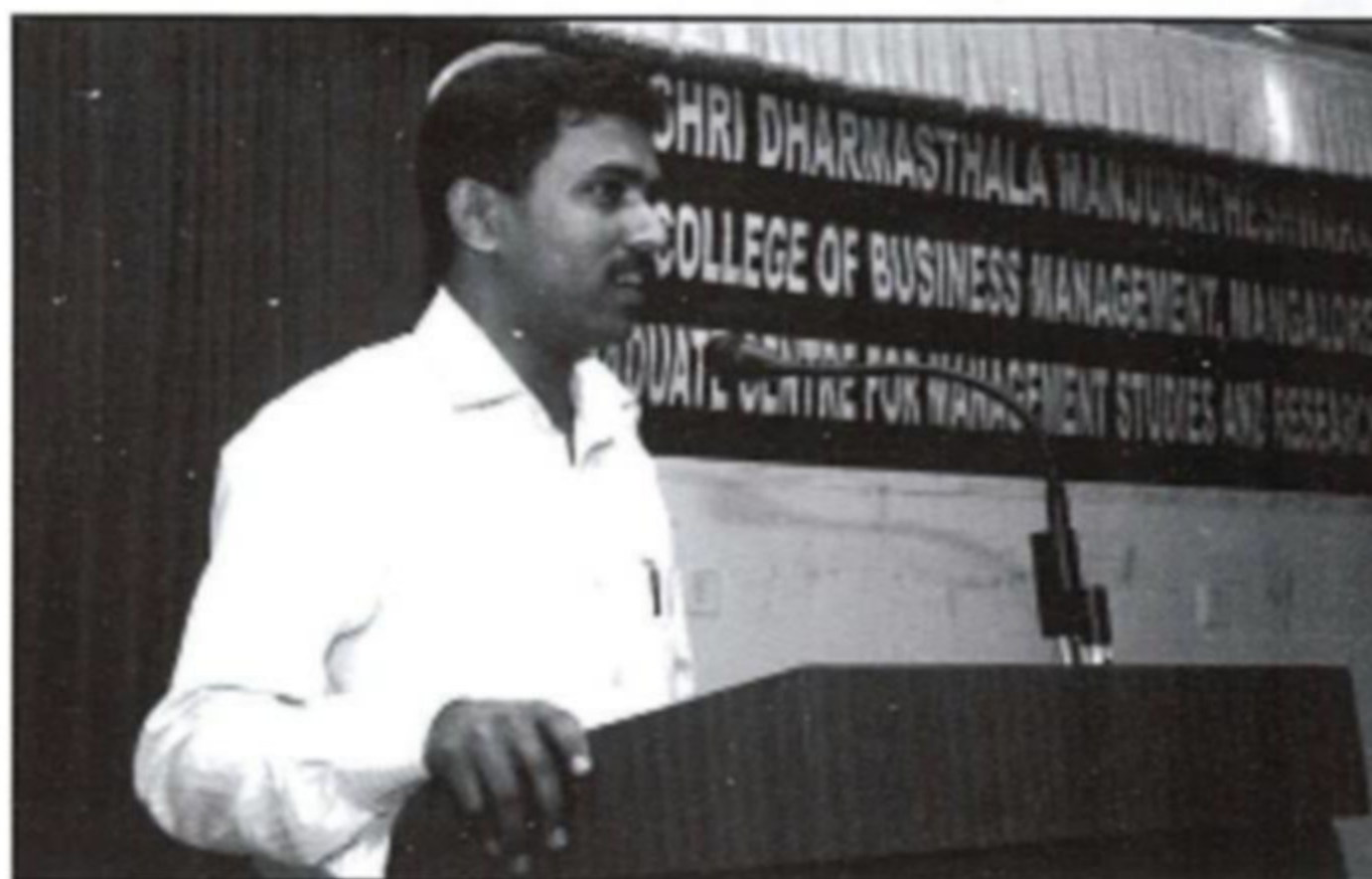
Finance Association Programmes