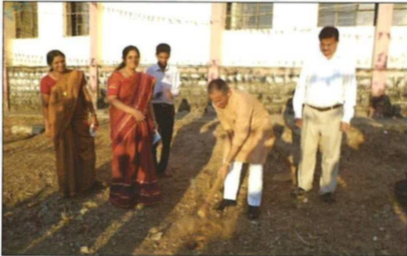
NSS Annual Camp