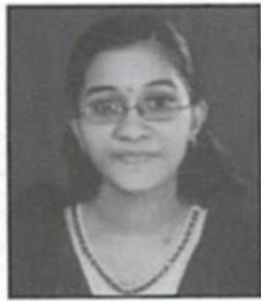
HEMA DAS T