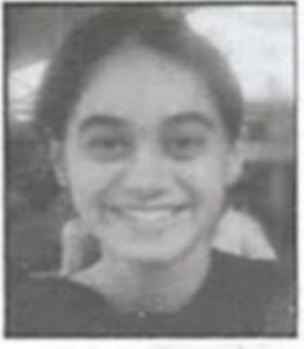
YASHICA Y RAICHURA