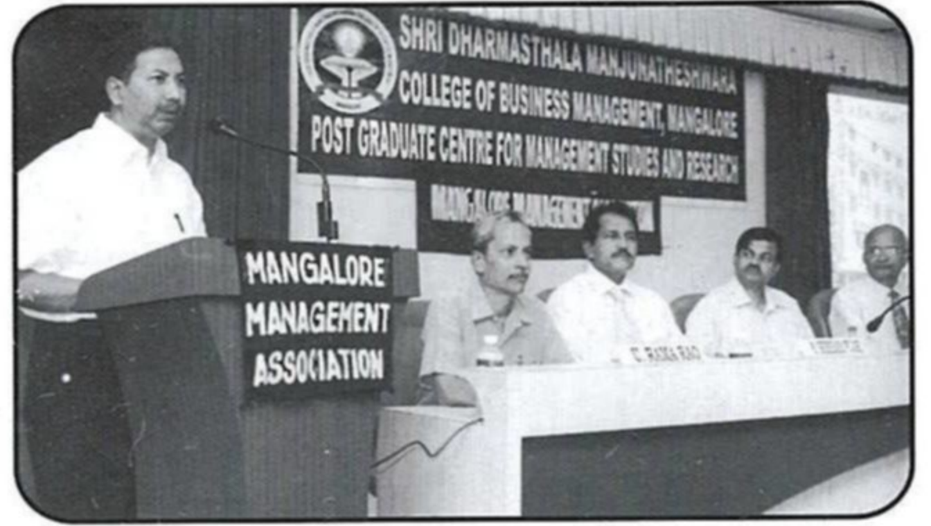
MANGALORE MANAGEMENT ASSOCIATION IN SDM COLLEGE