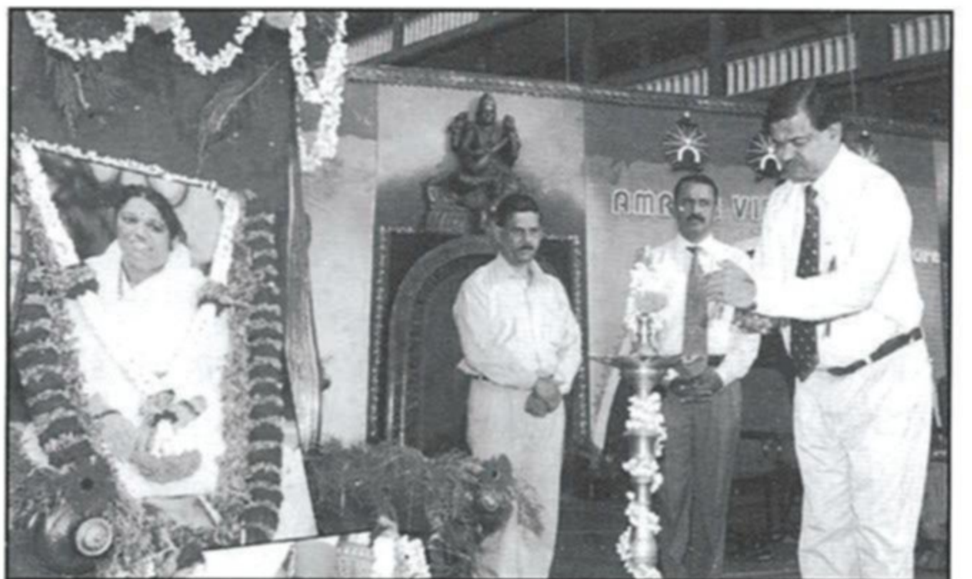
Our Principal was invited to be the Chief Guest to the Decennial Programme of Mata Amritha Maya Vidyalaya, Mangalore