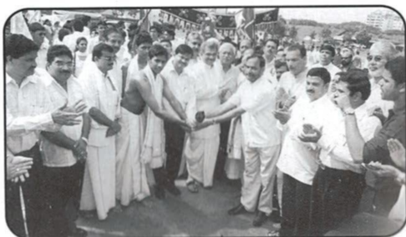
Procession Inauguration by Hon'ble Mayor Sri Shanker Bhat, M.C.C.