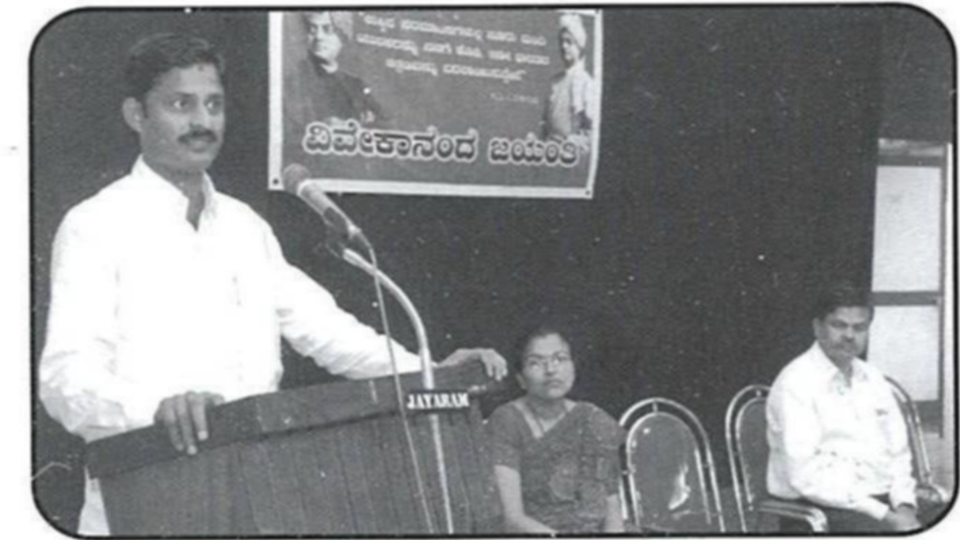
SWAMI VIVEKANANDA JAYANTHI CELEBRATION