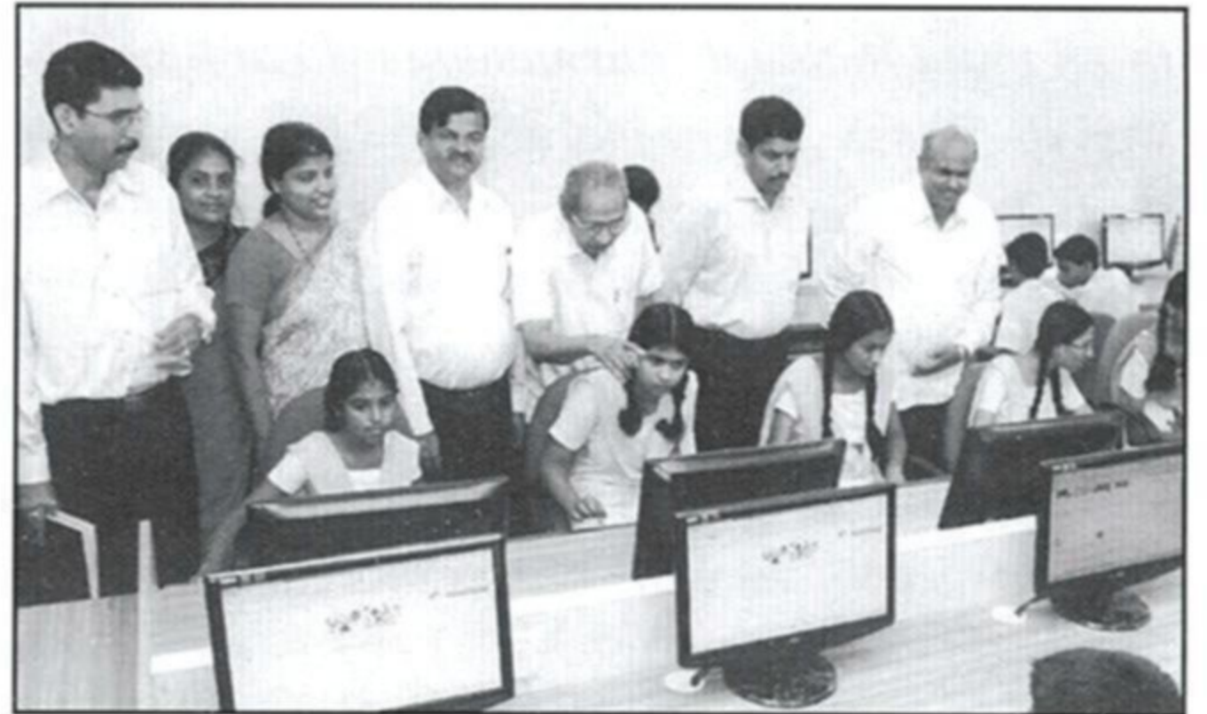
Student Internet World