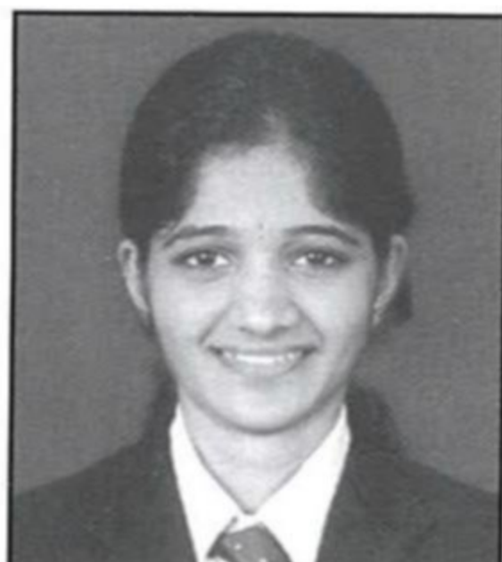
Supriya II Rank-MBA