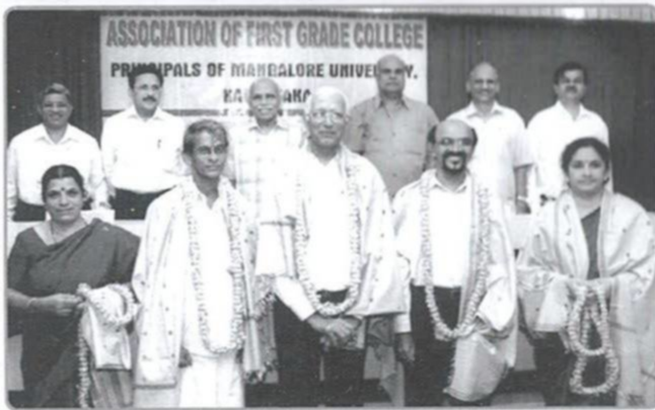
Honouring retired Principals