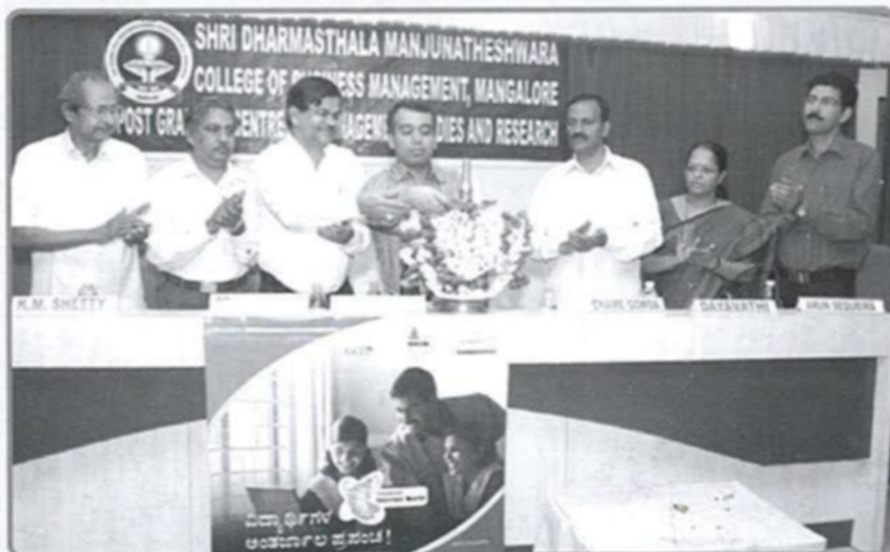
Student Internet World