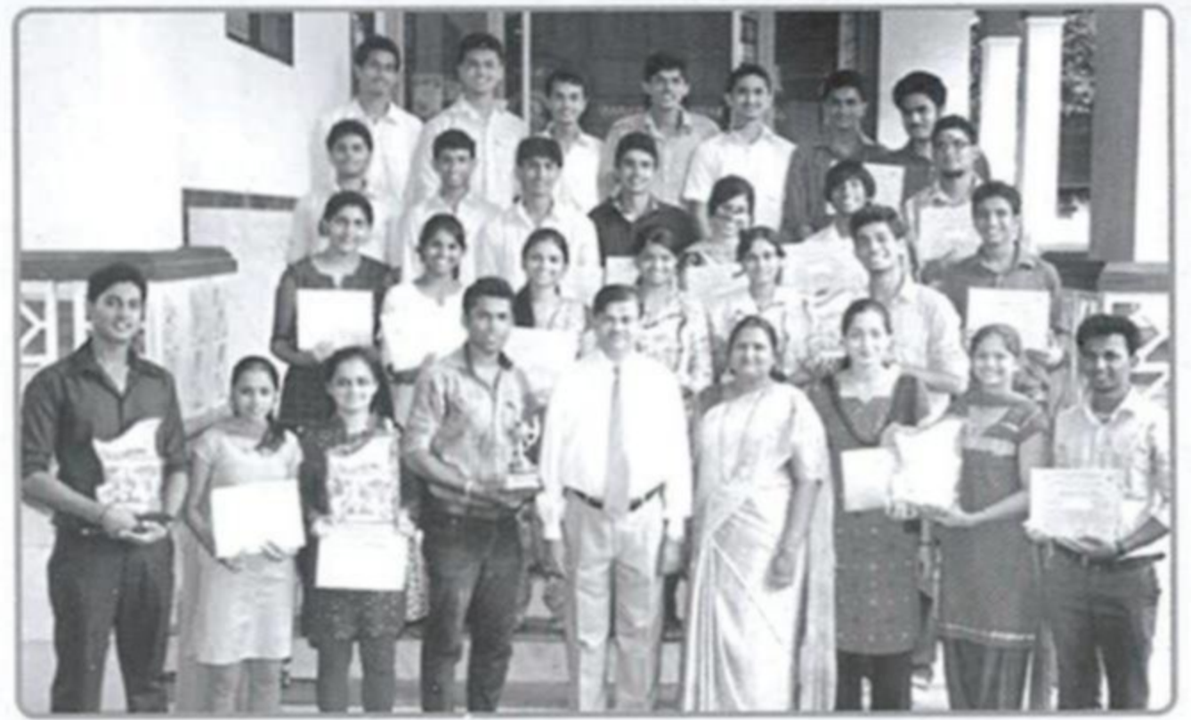
Overall winners in intercollegiate competition