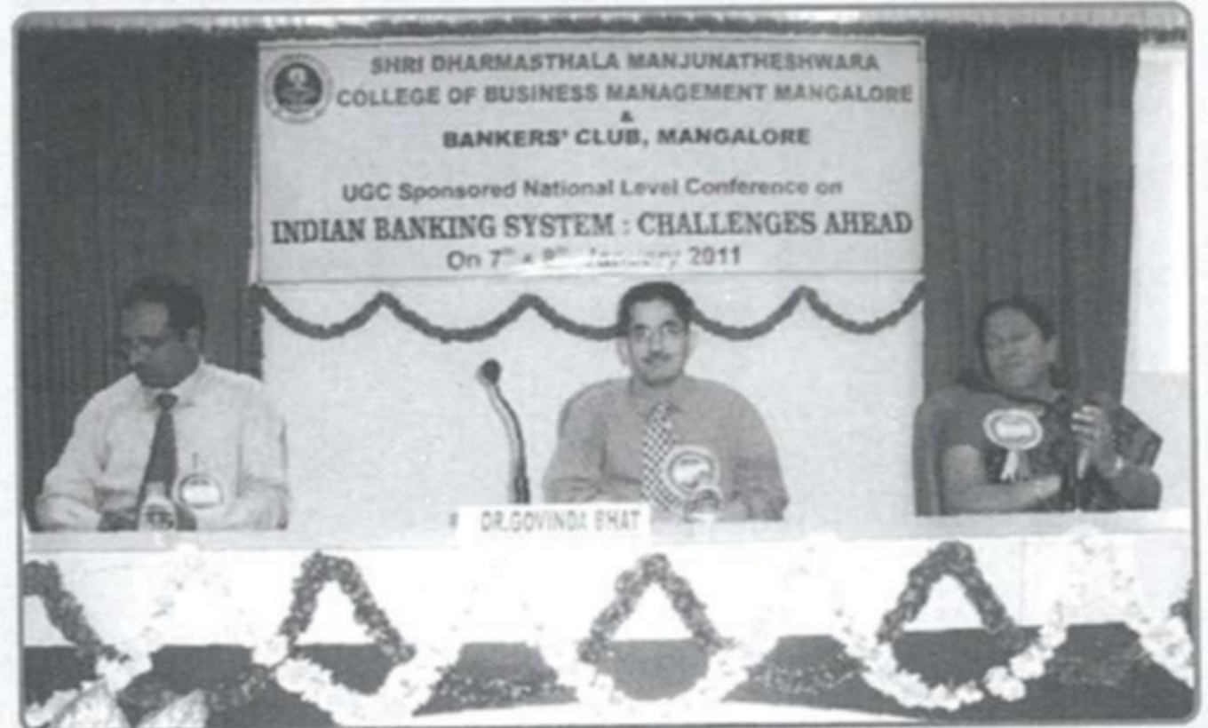
IV Technical Session