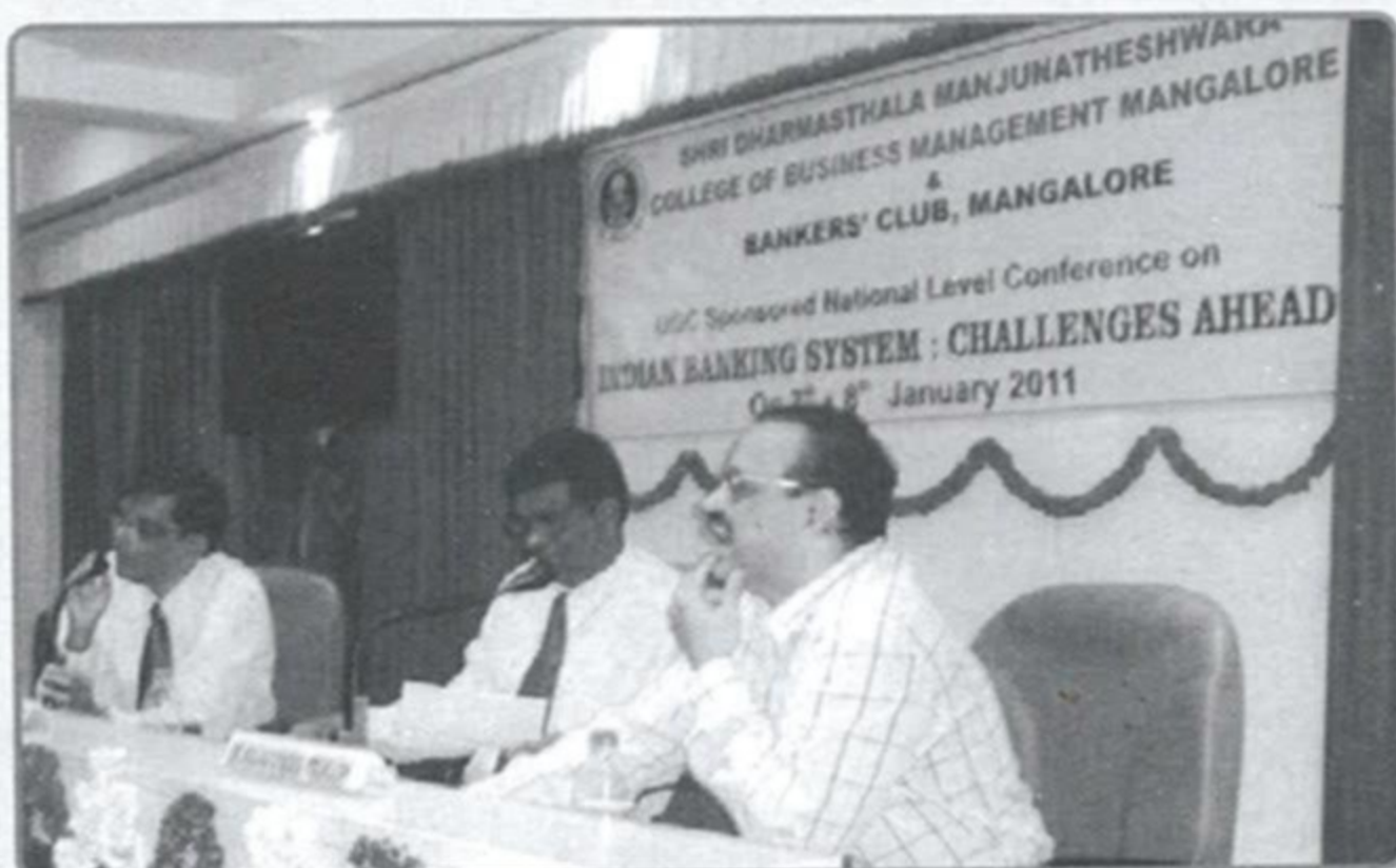
III Technical Session