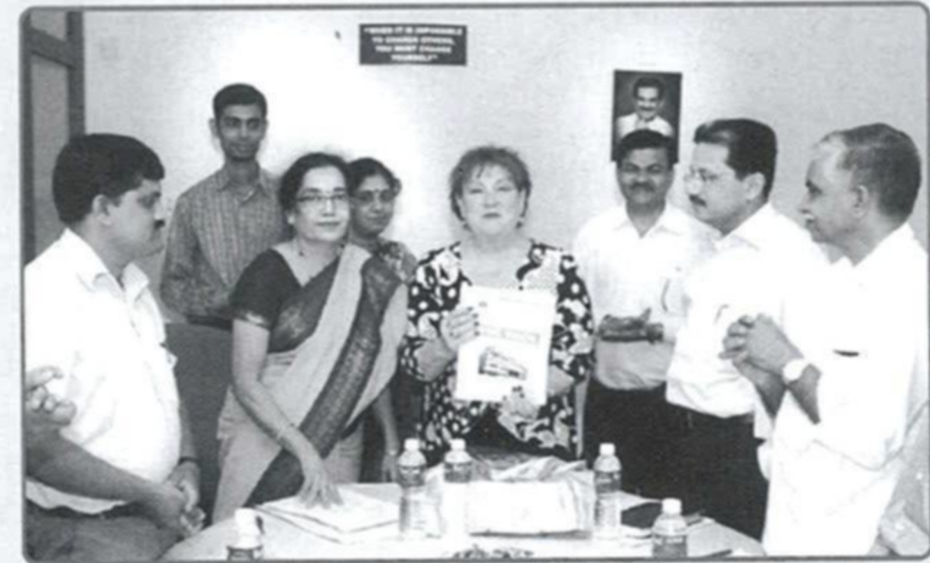
Release of Sync vision