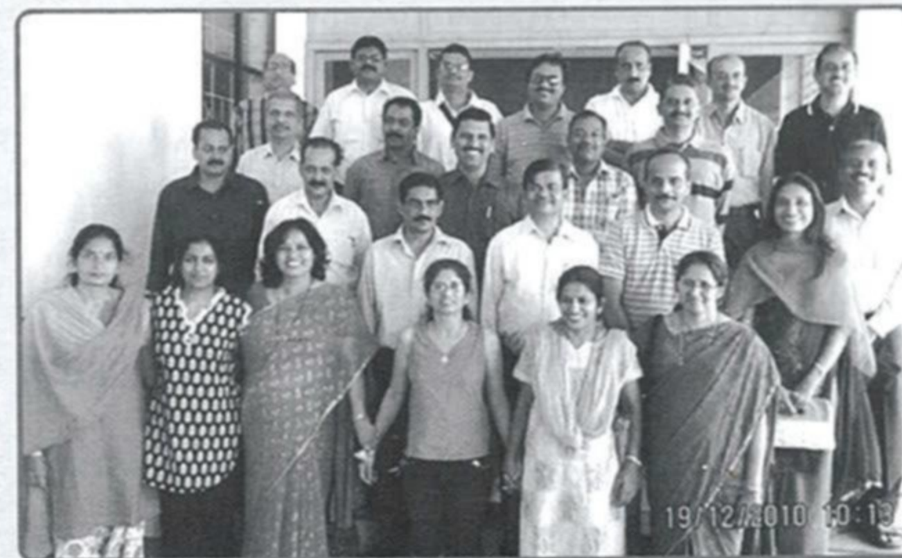
Alumni (1980-83 batch) Meet