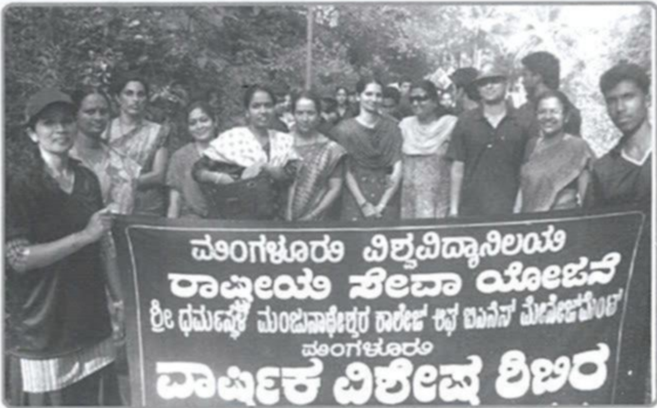
NSS Annual Special Camp