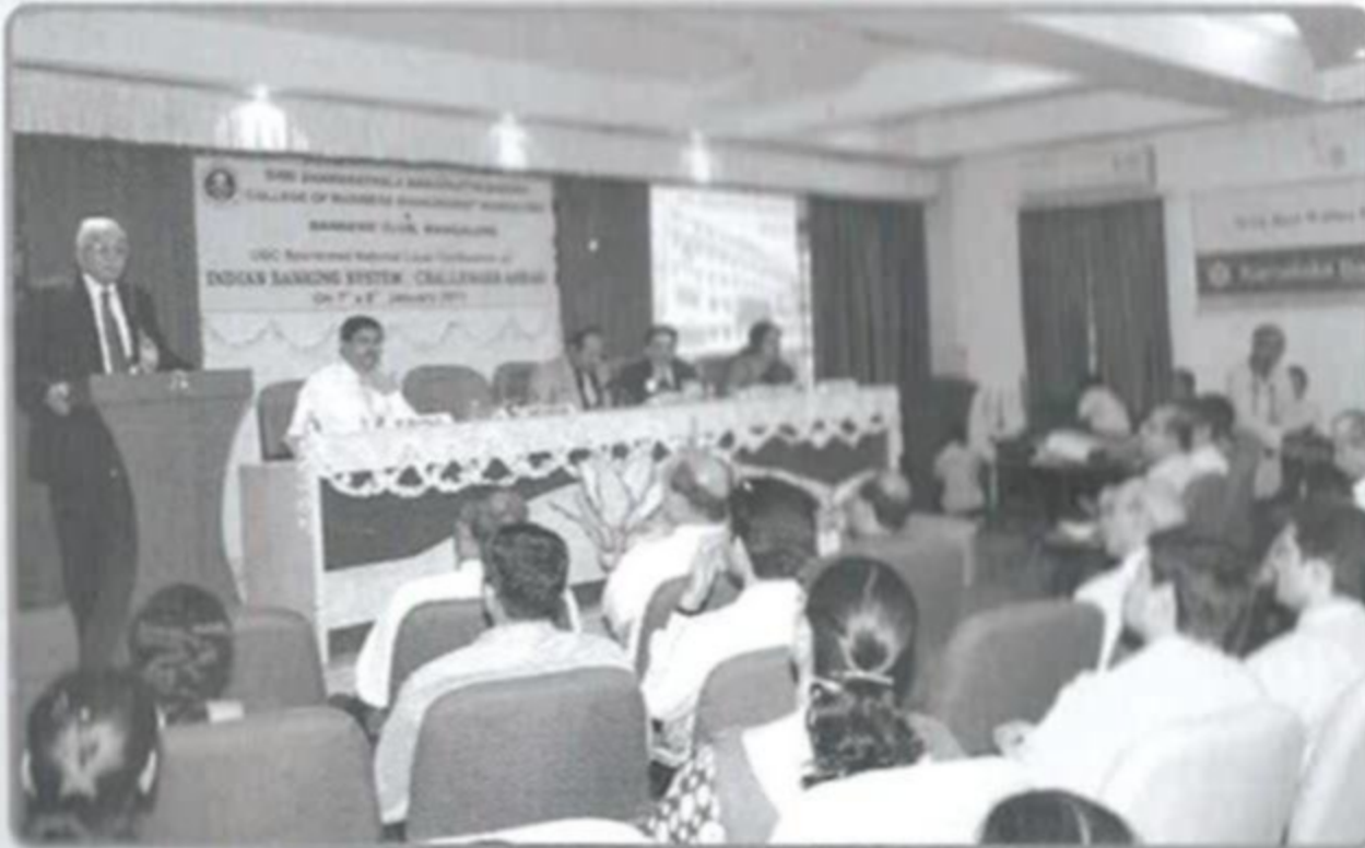
Inaugural & key note address