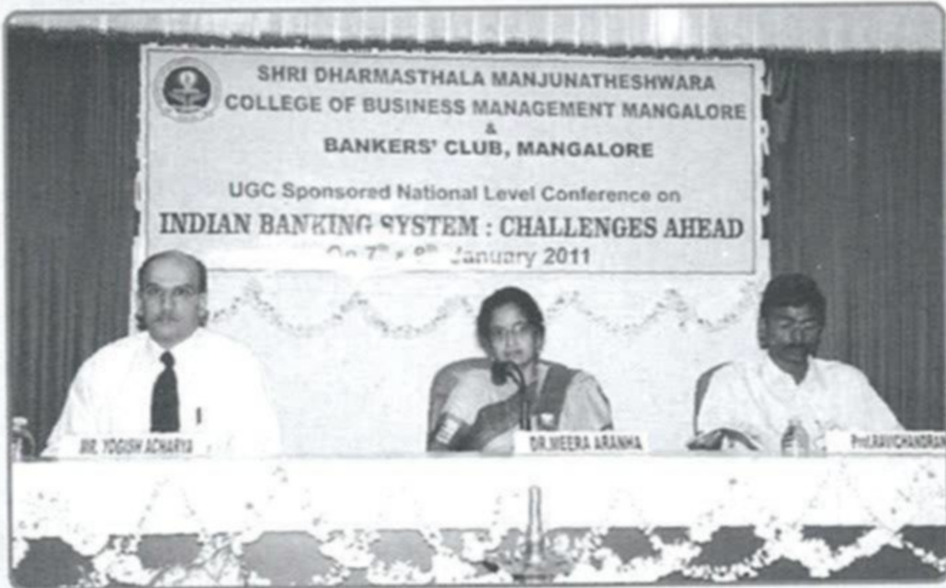
I Technical Session