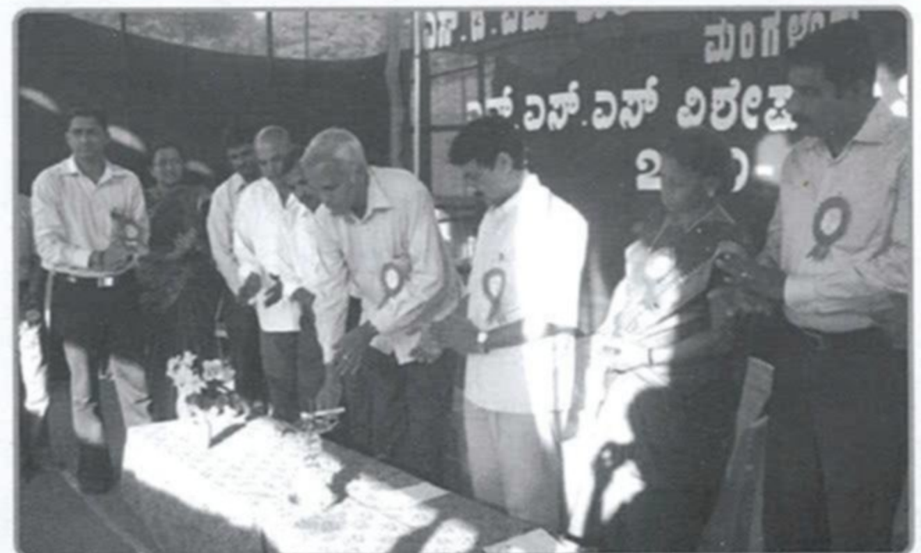
Inauguration of NSS Special Camp