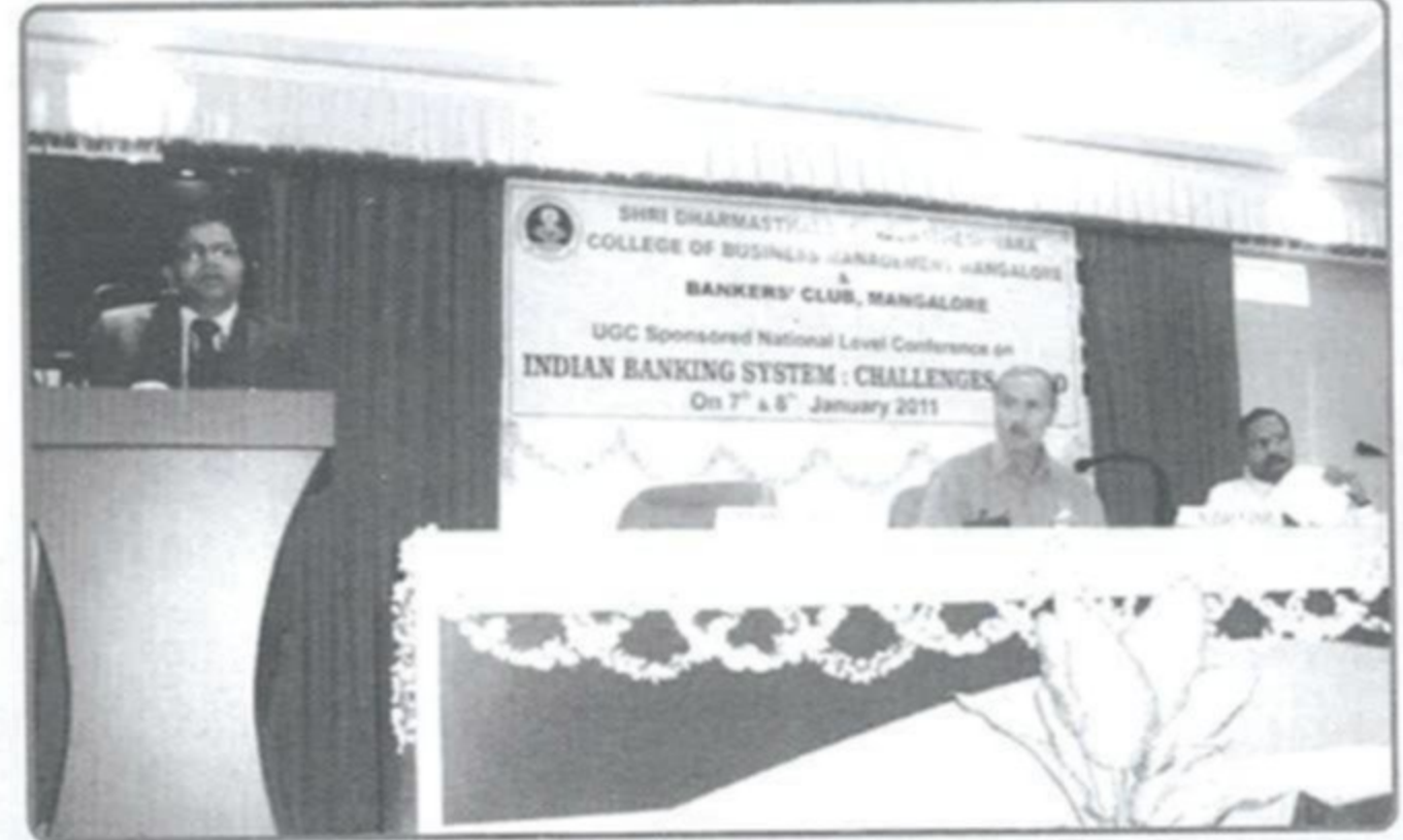
II Technical Session