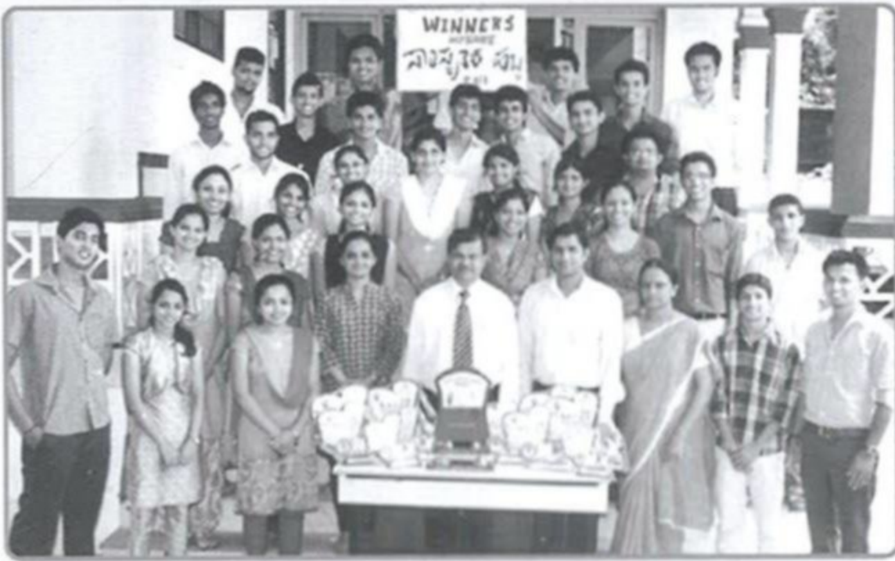
Winners of cultural fest at Mysore