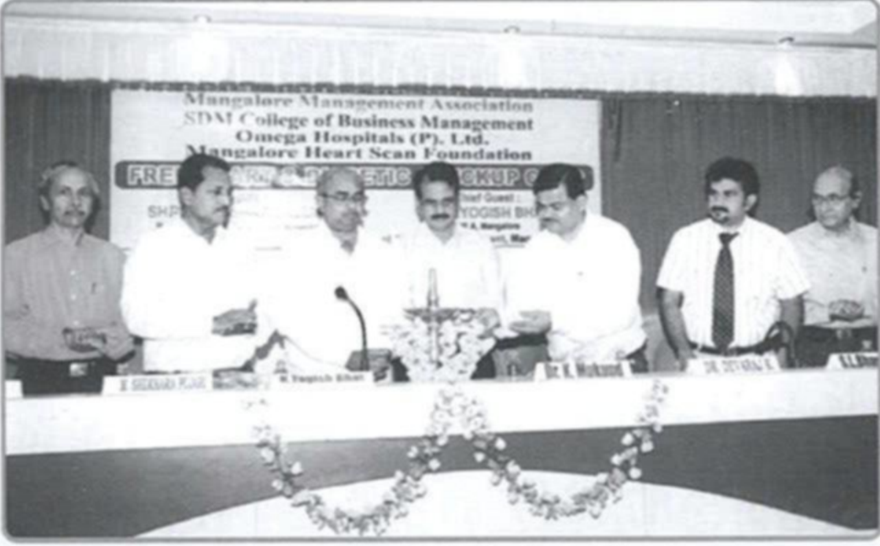
Free Heart Check-up Camp