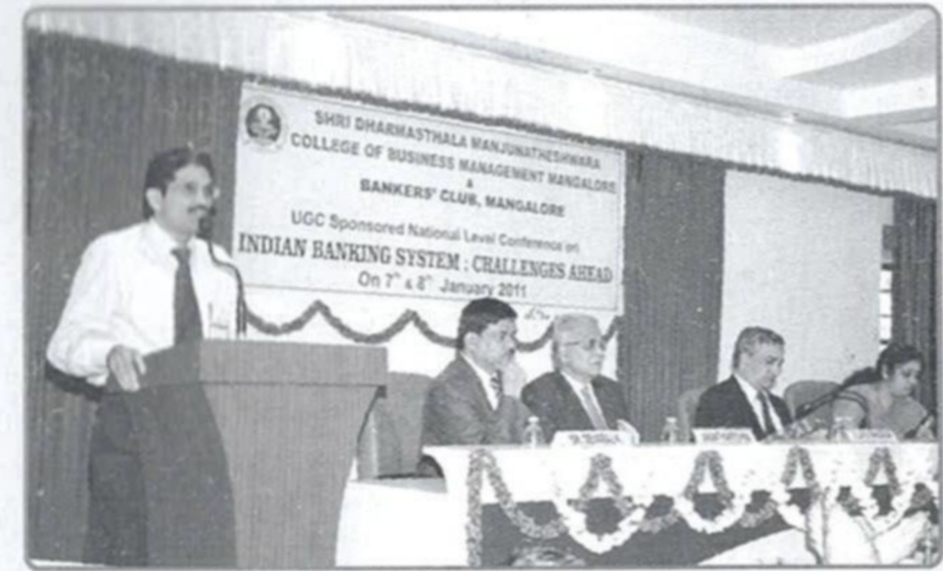
Feedback from participants.