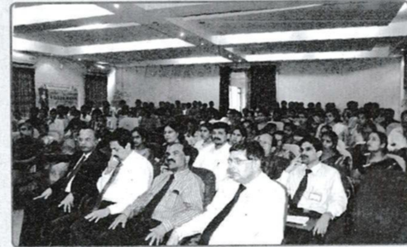
Engrossed audience at the valedictory