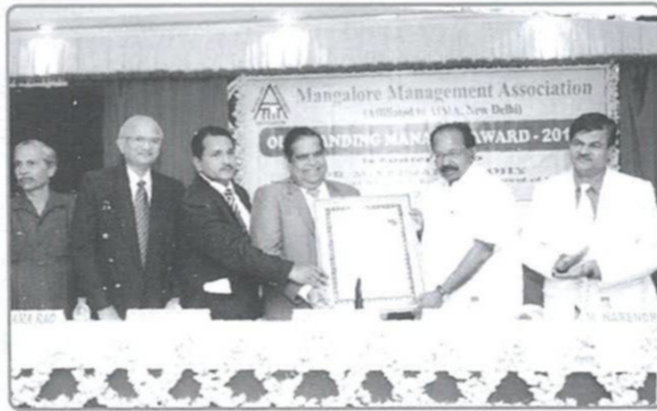
Honouring Law minister Dr.M.Veerappa Moily