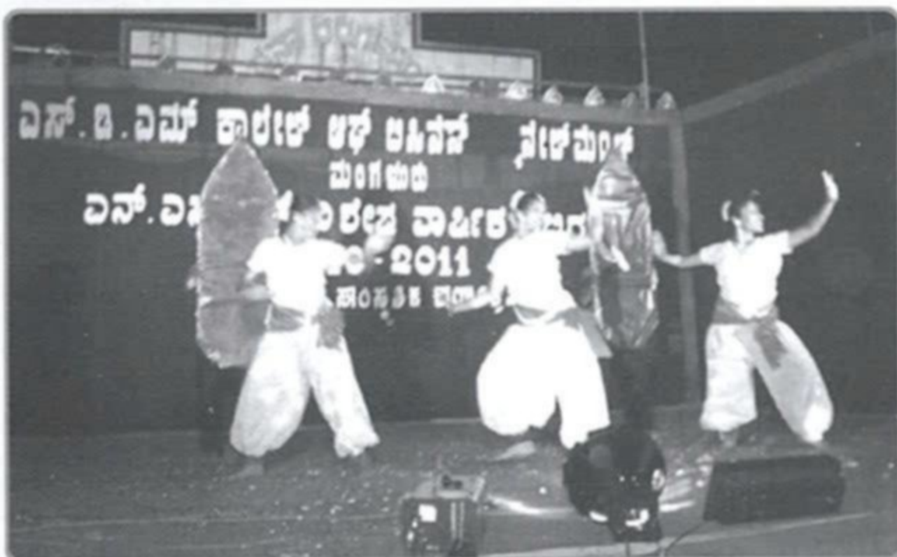
NSS cultural activities