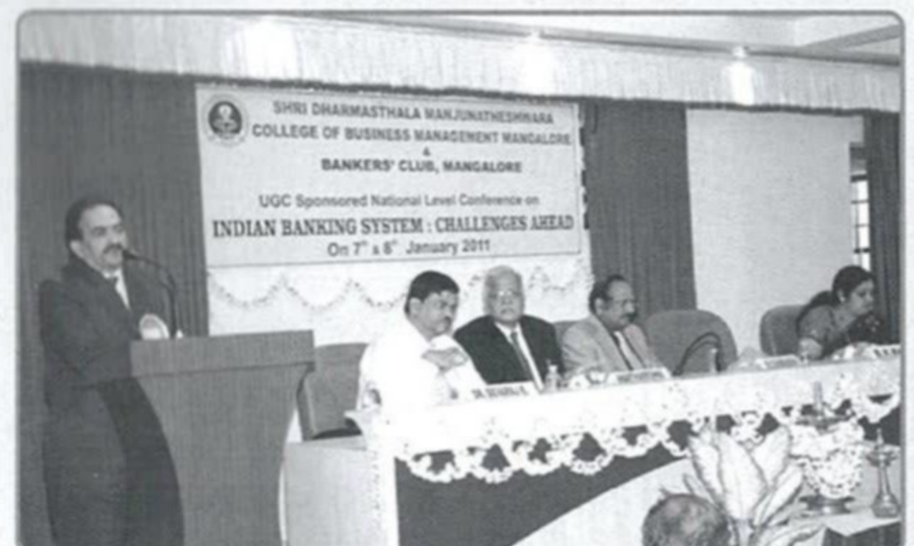
Chief Guest address