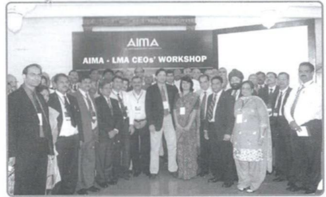
AIMA Conference at Kolkata