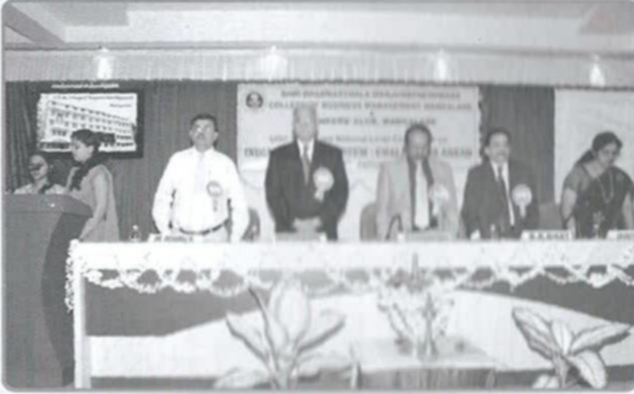
Invoking blessings by students