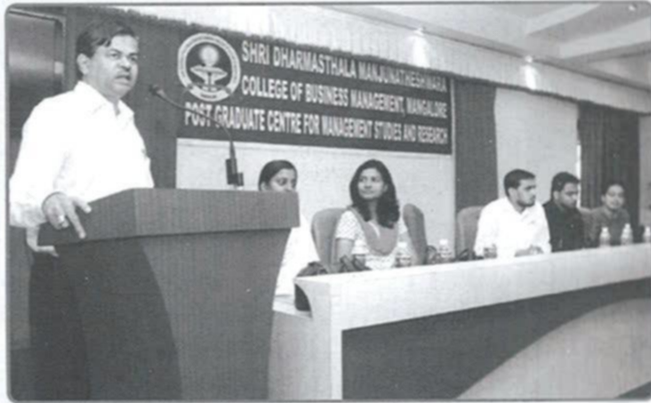
Training by Corporate executives to MBA students